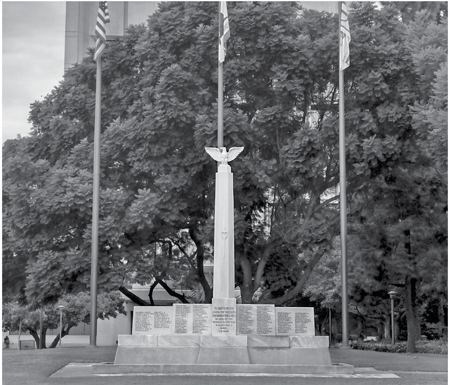
On a small, grassy plaza at Inglewood's City Hall stands the Memorial Obelisk Monument. Supported by a stone panel at its middle, the memorial is engraved with the phrase, "To keep forever living the freedom for which they died. We dedicate this memorial to our dead in World War II, Korea and Vietnam." The names of those who perished are on either side of the memorial. In the middle is a column with a sword and wreath, and on top, an eagle.